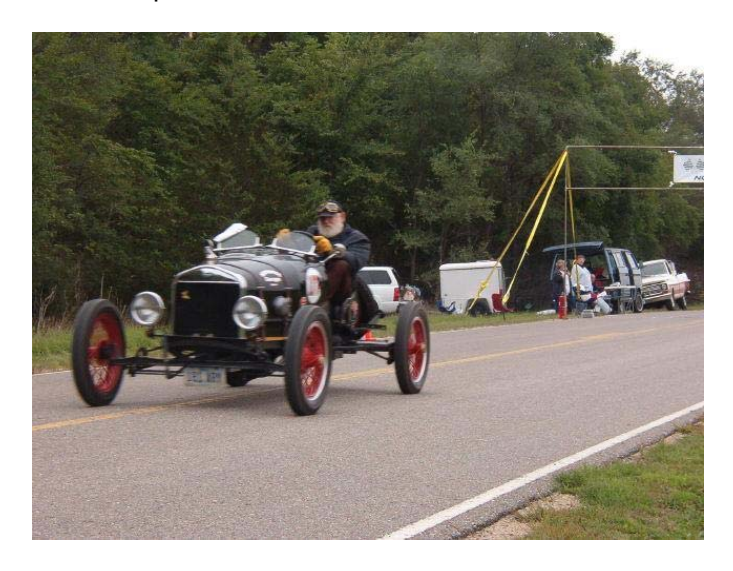
Restored Model A