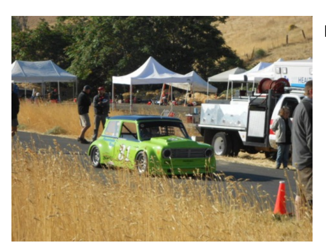
Figure 10 - A Vauxhall FORETECH Mini

tube chassis Mini now powered with a Vauxhall motor. FORETECH is owned by Mike Kearney who is the king of the machine shop at Seven Enterprises in Auburn, CA.