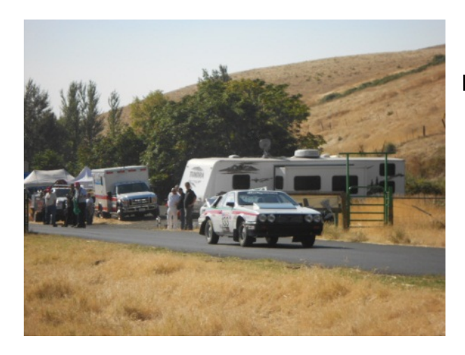
Figure 6 - A vintage rally prepared Lancia Scorpion