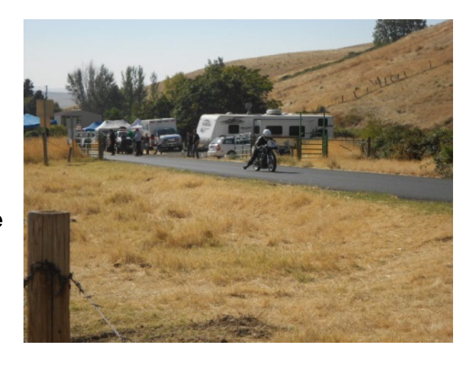
Figure 13 - A vintage motorcycle starting the ascent