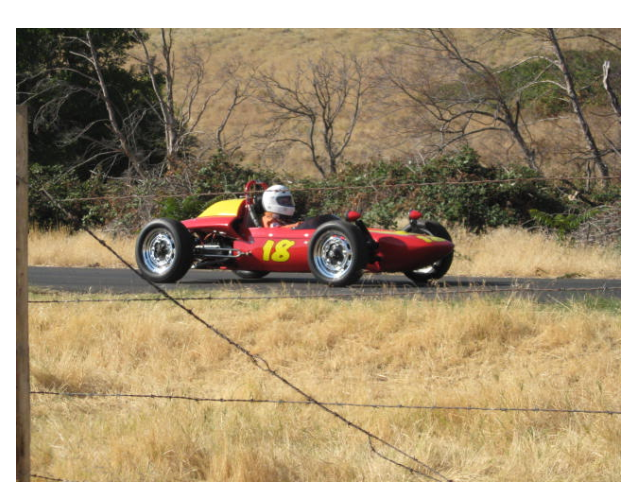
Figure 4 – A Formaula Vee leaving the starting line

he best place to photograph the cars was just as they left the start line. Actually, that is the only place at the bottom of the hill. Spectators are restricted from walking up the hill and the spectator shuttle must share the course between run groups to deliver passengers. Saturday features familiarization runs followed by a car show. Sunday is race day – two attempts in the morning and two more after lunch. Because of the small pit area SOVREN will not allow spectator access to the cars or drivers. So you sit in a dry, grassy field spattered with gifts from the grazing cows hugging a barb wire fence for photos.