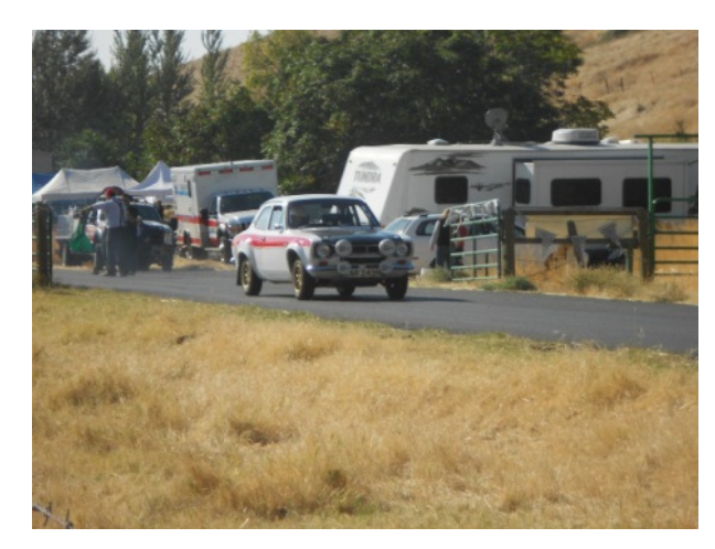
Figure 7 - A vintage rally prepared Ford Escort