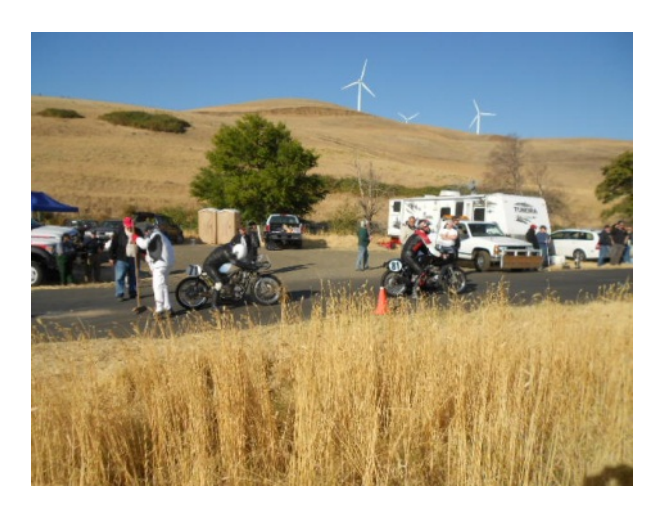
Figure 12 – Vintage British motorcycles at the starting line.

I will close with three unique competitors who added an extra degree of difficulty by racing vintage British motorcycles – a Norton Commando; a Triumph T150 and Seeley/Weslake. (Figures 12 and 13) I like the last photo with the rider fighting for balance at the start. Maybe PHA should look into this class.