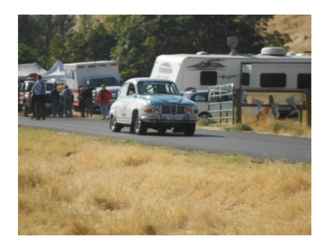
Figure 8 - A SAAB 96 V-4