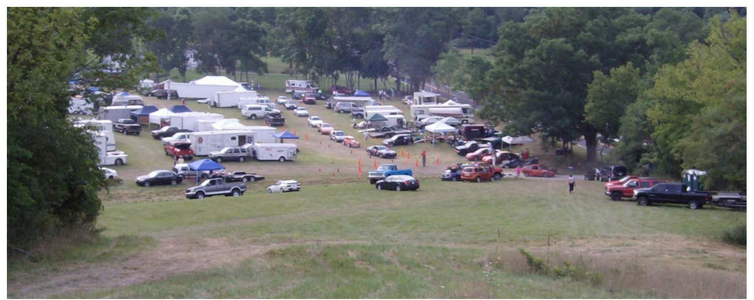
The Paddock Area at The Polish Mountain Hillclimb