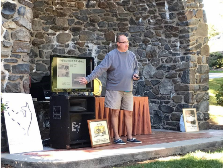
Presenting in the Beehive...

This prompted the Society to invite me back (for the third time) to do the full History of The Hershey Hill Climb presentation. I last did it in 2012!! Which I can't believe...This is the time to come out and hang out with PHA friends from the past! I hope to freshen up the presentation with new photos...and I hope to have a new film to show....so come on out....!!! The 2012 event was filled with PHA Veterans and was standing room only...get there early!! I'm hoping to break the record for attendance!!!