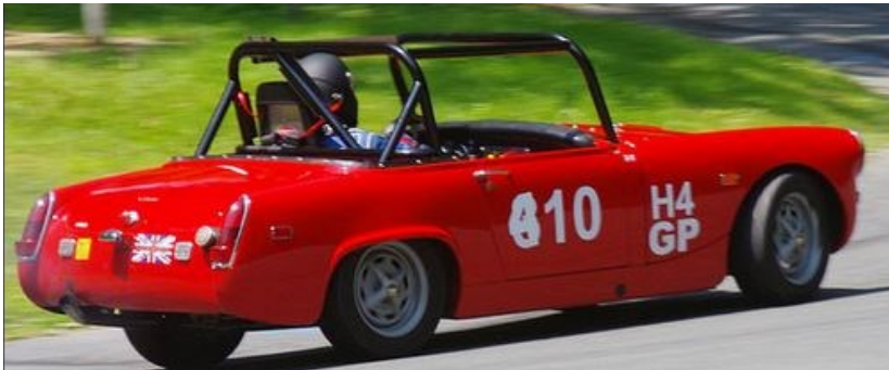
#4 Ian Wagner