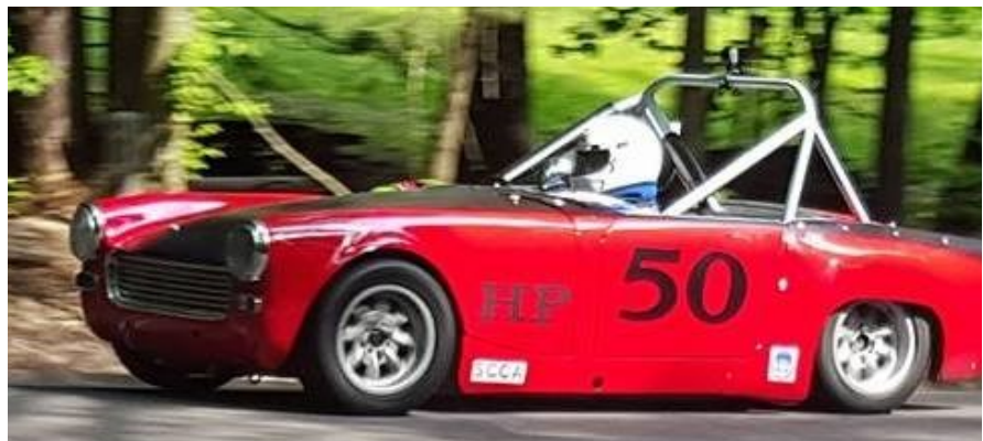
#5 Joe Whiteley