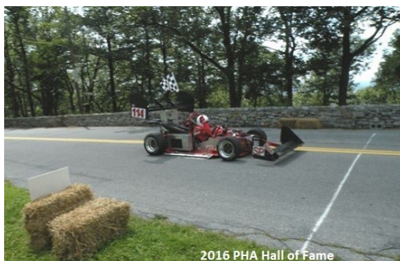
2016 PHA Hall of Fame