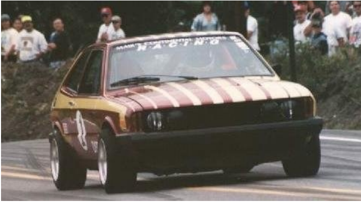
#1 Rolf Mair