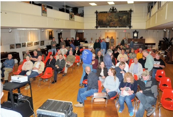
As the crowd starts to show up....

On November 15th, the Lebanon County Historical Society opened their doors to the PHA! I was asked to do a presentation on hill climb racing in Lebanon County. At the cost of getting this newsletter out a month late...I actually got things together enough to pull this off! As with all presentations...we make them a gathering point for PHA Veterans and active drivers to come out and see old friends and meet new ones. This outing was no different than any other...we had a huge turn out...a saw a lot of smiles and laughs! The presentation went well...the social time after the presentation at the Society and later across the street at Snitz Creek Brew house was great! Thank you to all those that came out...It was good to see so many familiar faces!