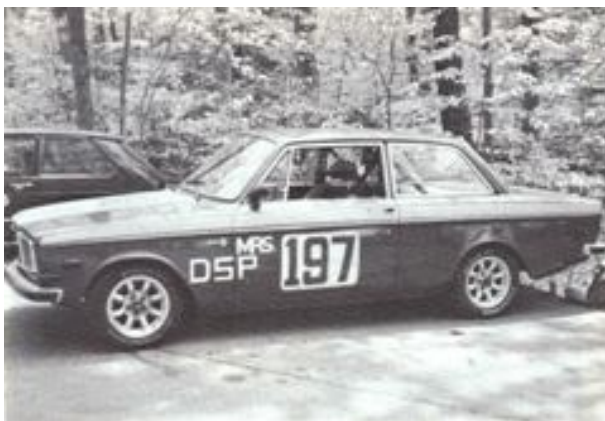
#5 Patty Enzman—Alspach