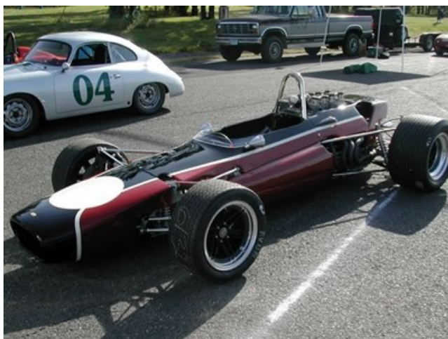
As the car looked in 2010