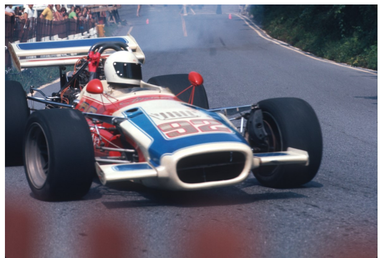
As the car looked back in the PHA days!