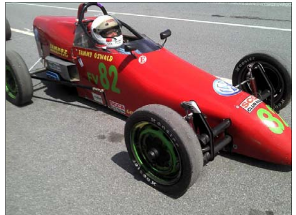
#5 Tammy Oswald