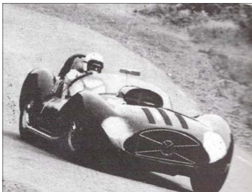
Car in action at Giant's Despair