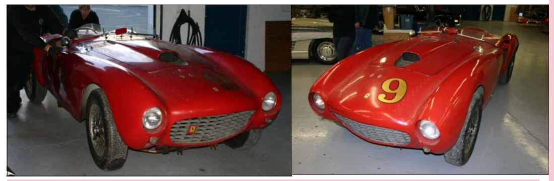
Car being rolled into the shop for a clean up prior to Pebble Beach

In June of 2010 I was contacted by an Auto outfit that was looking for some documentation on a Ferrari they just uncovered. The car was to be shown in the preservation class at Pebble Beach and they were looking for some goodies to add to the "show book".