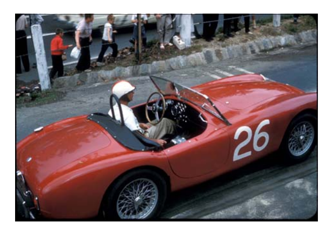
Photo ID: Well...we struck out last month. No one could help ID the three photos. I hope we have some better luck this issue!! Here are four shots, one from each decade: 50's, 60's, 70's & 80's.

Remember, if you have a need for a speaker for a meeting...and I might fit the bill let's talk. Currently I have 3 prepared presentations covering the Hershey Hill Climb, Fleetwood Hill Climb & Corvettes and PA Hill Climbing. I'm open to create a new presentation on a particular hill or car type if need be...l just need some advanced time to prepare.