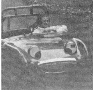
PHOTO ID'S NEEDED: As stated before, a large number of photos in the collection need ID'ed. I will have a segment in the newsletter, send a few out on the email distribution list or you could set up a time to come visit sometime!

I look forward to organizing gatherings, continuing to do presentations and meeting as many of you as I can. Although, I have a small budget allotted to me from the PHA...much of what I'll be doing will be on my own. The PHA's history is too rich for it to be lost and forgotten...that's why I'm here!