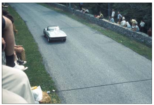
Above: photo taken from a top of the wall in front of where the Summit Hotel once stood - circa 1968