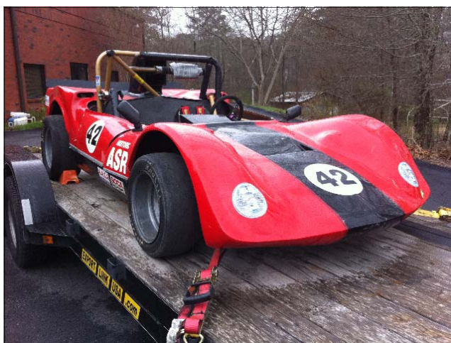
This car was FTD winner at Giants Despair in 1980 with a time of 51.185