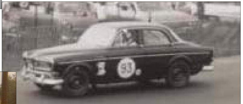
#4 Carl Mueller