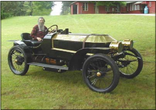
My original contact in his Stanley Steamer!