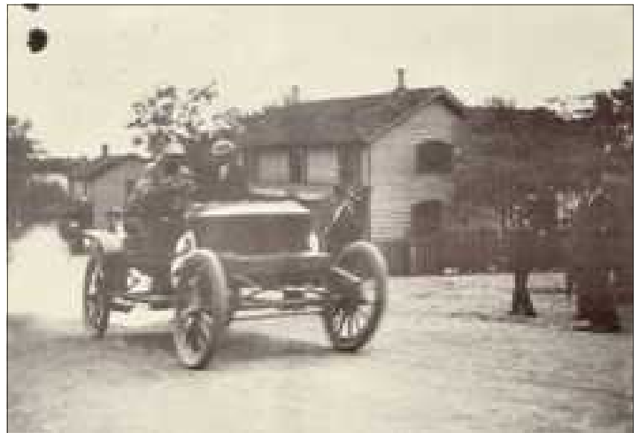
Unknown driver in a Stanley Steamer at Giant's Despair