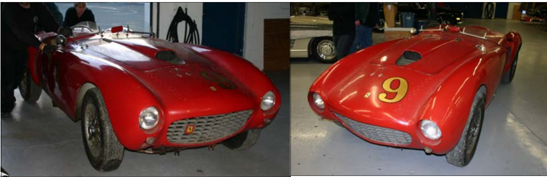
Car being rolled into the shop for a clean up prior to Pebble Beach

In June of 2010 I was contacted by an Auto outfit that was looking for some documentation on a Ferrari they just uncovered. The car was to be shown in the preservation class at Pebble Beach and they were looking for some goodies to add to the "show book".