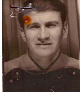
New Jersey Healey Driver