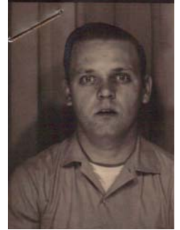
Drove a Touring Saab