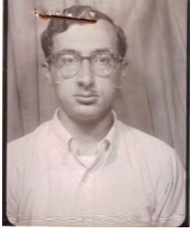
Shelby GT 350 Driver