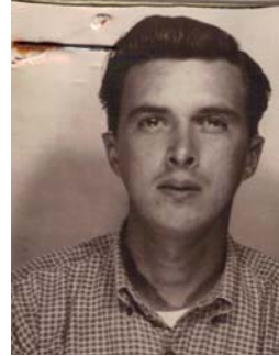
#133 GP Datsun Driver