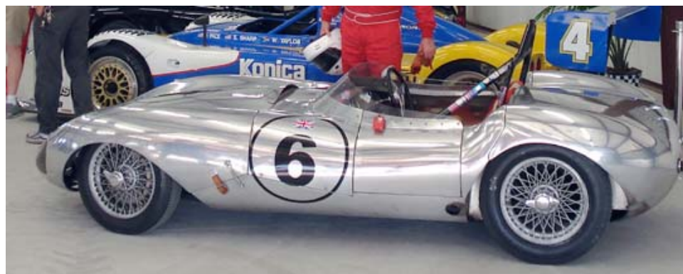
The car as it looks today, here photographed at Sebring in 2009.