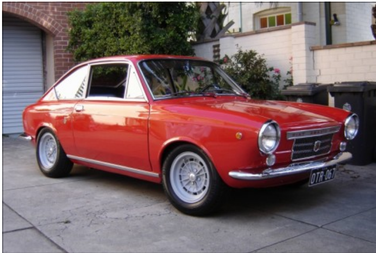
Restored car in Australia!