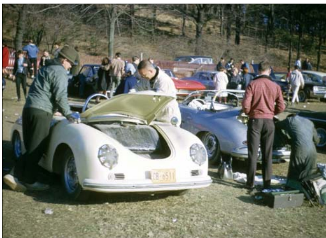
Group of Speedsters at Hershey