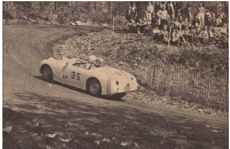
Sprite at Weatherly